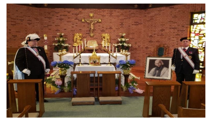
The Relic with the reception Honor Guard posted

Diocese chose the Chapel of Our Lady of Providence Seminary for displaying the Relic. The Patriotic Degree of the District of RI provided an Honor Guard for the event, with Sir Knights from throughout the District participating.