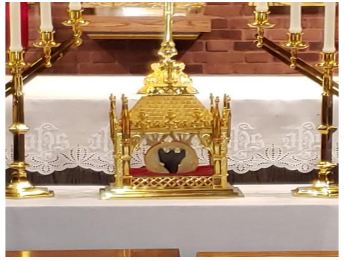
The Relic at the front of the Sanctuary

Each Monday in May, SS John & James is sponsoring Holy Hour and Exposition at St. Mary's church beginning at 7 pm